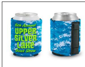
Magnetic Koozie RC Page