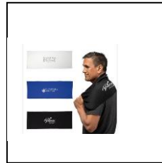
Cooling Towels** Casey Development

(** + name on two cooling stations on each course)