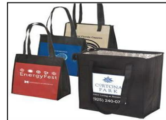
Tote Bag CDS Muery