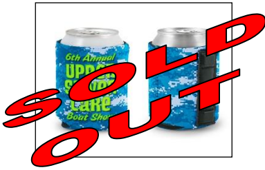
Magnetic Koozie Tote Bag