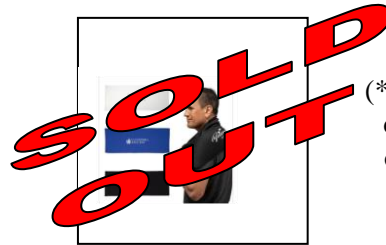
Cooling Towels** (LJA Engineering)

(** + name on two cooling stations on each course)