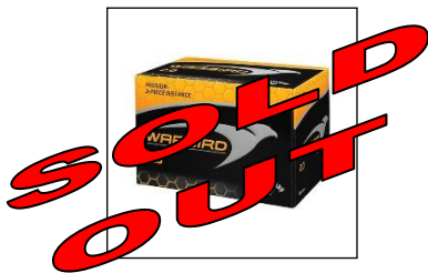
Golf Balls (KCI Technology)